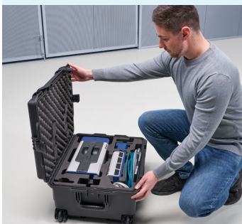
the new VibroScan QTec: compact and ideal for portable use