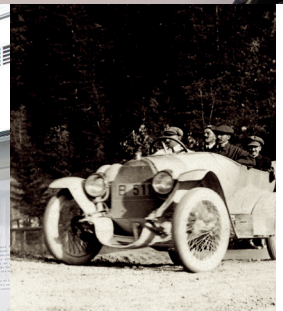
Austro Daimler 1912