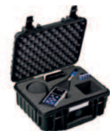
SA 72 Waterproof carrying case