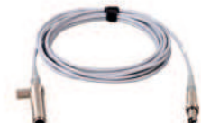
SC 91A Microphone Extension Cable